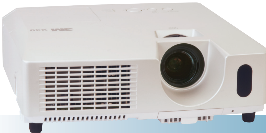
3M X30 Projector 78-9236-7712-0

The 3M Digital Projector X30 features 2,600 lumens of brightness and a 2000:1 contrast ratio for exceptional picture quality. Backed by the 3M brand for superior performance and reliability, the X30 is easy to install and transport at only 7.9 pounds. A new hybrid filter operates for up to 4,000 hours under normal conditions enabling savings in maintenance costs over the lifetime of the projector. It is ideal for education users and business environments where advanced picture clarity and ease of use is a must.