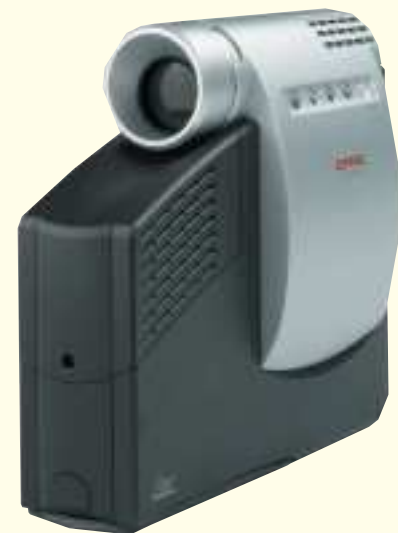
Compaq MP1600 Microportable Projector

An integral part of the Compaq family of products designed to help mobile professionals achieve a competitive advantage for their business, the MP1600 Microportable Projector works together with our notebooks and handheld portable solutions as well as Compaq desktops and workstations, to give traveling professionals the ease of use, quality, reliability and enhanced productivity they need.