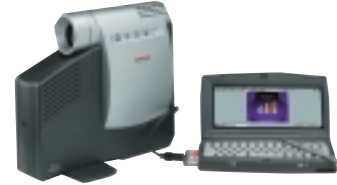
MP1600 with Compaq C-Series

The world's first microportable projector, with easy portability, plug-and-present technology and extraordinary brightness for great presentations.