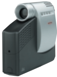
MP1600 Microportable Projector