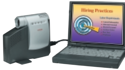
MP1600 with Compaq Armada