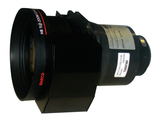
Universal lense range: one lense range for RLM, SLM and FLM.