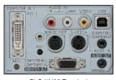
PLC-XU25 Terminal Input Panel

Because its products are subject to continuous improvement, SANYO reserves the right to modify product design and specifications without notice and without incurring any obligations.