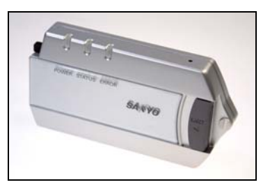
Optional Multi-Card Imager (POA-BOX20)

Because its products are subject to continuous improvement, SANYO reserves the right to modify product design and specifications without notice and without incurring any obligations.