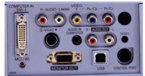
Input / Output Terminals