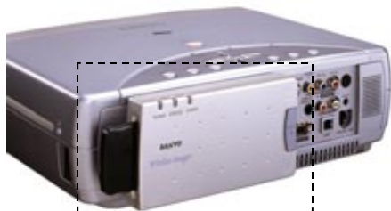
Optional Wireless Imager (POA-WL11) (Includes 1 wireless LAN card for projector)

Because its products are subject to continuous improvement, SANYO reserves the right to modify product design and specifications without notice and without incurring any obligations.