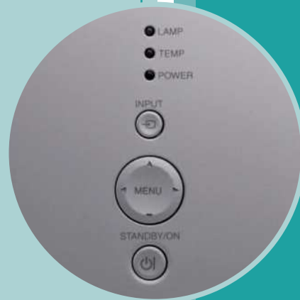
Multi Function Controls