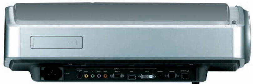
Side Panel View