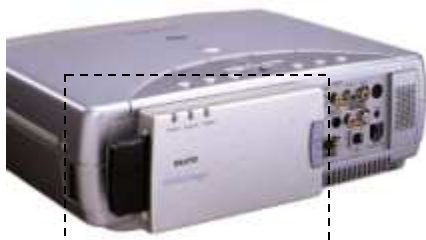
Optional Wireless Imager (POA-WL11) (Includes 1 wireless LAN card for projector)

21605 Plummer Street Chatsworth, CA 91311 Ph: 818.998.7322 ext. 288 Fax 818.717.2719 www.sanyolcd.com