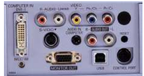
Input / Output Terminals