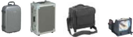
VT60ROLLER VT60ATAPRO TRAVELPRO200 LAMP