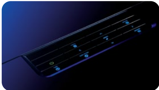
InFocus LiteTouch Keypad

The sleek backlit LiteTouch control panel provides one-touch access to the most commonly used projector functions.