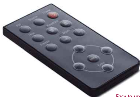
Easy-to-use remote included.

Produces clear, crisp images including detailed spreadsheets.