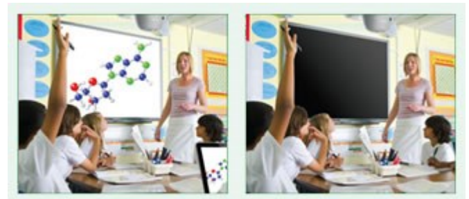
Eco AV mute off 100% power consumption

Stay in control of your presentation with Eco AV mute. Direct your audience's attention away from the screen by blanking the image when no longer needed. This also reduces the power consumption by up to 70%, further prolonging the life of your lamp.