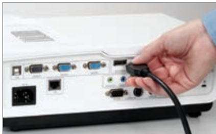
Connect and project.