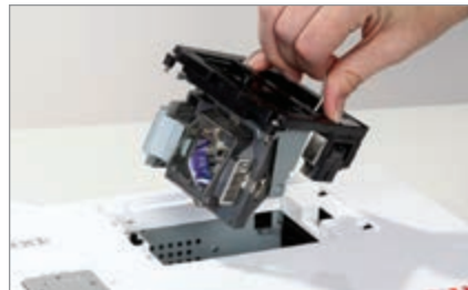
Easy to change long-life lamp.