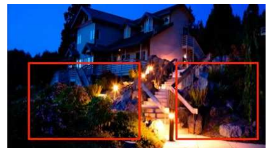
Contrast Enhancer ON