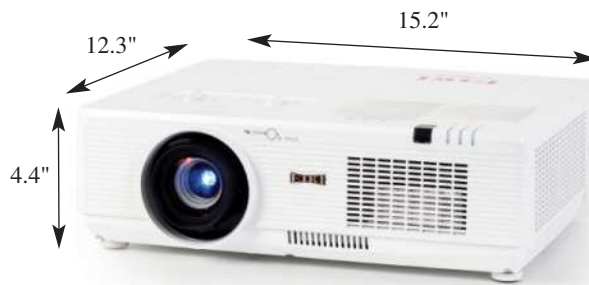
LC-WBS500 • WXGA projector. LC-XBS500 • XGA projector.