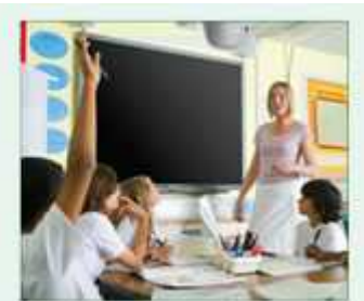
Eco AV mute on 25% power consumption