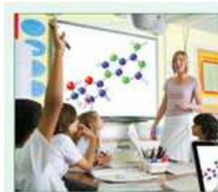
Eco AV mute off 100% power consumption

Stay in control of your presentation with the Eco AV mute feature. Direct your audience's attention away from the screen by blanking the image when no longer needed. This also instantly reduces the power consumption to 25%, further prolonging the life of your lamp.