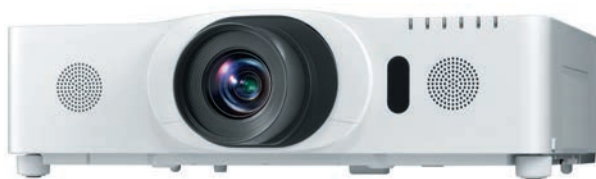
Front 3/4 View

compatible. Plus, embedded networking gives you the ability to manage and control multiple projectors over your LAN (scheduling of events, centralized reporting, image transfer, and e-mail alerts). Even with the array of advanced features, Hitachi's CP-X8170 is designed for user-friendly operation and installation convenience.