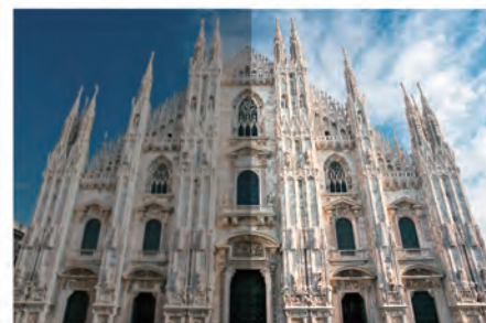
Normal 15,000:1 Contrast Ratio

The PJD7223 features 4,000 lumens brightness and a 15,000:1 contrast ratio to ensure the image will be crystal clear and vivid even in the bright environments. This feature allows the PJD7223 to adapt to various environments for greater flexibility in use.