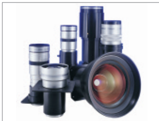
Broad selection of lenses.