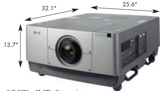
LC-XT6 • 3LCD+One projector (Shown with optional lens)