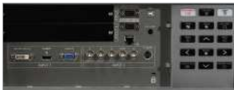
Built-in complement of professional inputs, and room for more. Choose from SD/HD-SDI, Dual-Link SDI, VGA/DVI and 5BNC/S-Video modules.

Replacement Lamps, Wideangle, Midrange and Telephoto Lenses, Additional DVI-D & Dsub15 Input Module, Additional 5BNC & S-Video Input Module, HD/SD-SDI Input Module, Dual-Link SDI Input Module, Replacement Air Filter Material Kit, Replacement Smoke Resistant Filter Material, ATA-Style Shipping Case with Wheels and Telescoping Handle, Ceiling Mount, Ceiling Post & Plate.