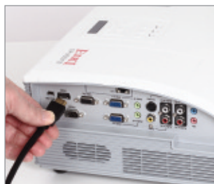
Connect and project.