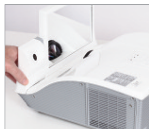
Optional Interactive Features.