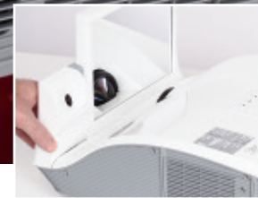
Optional Interactive Features.