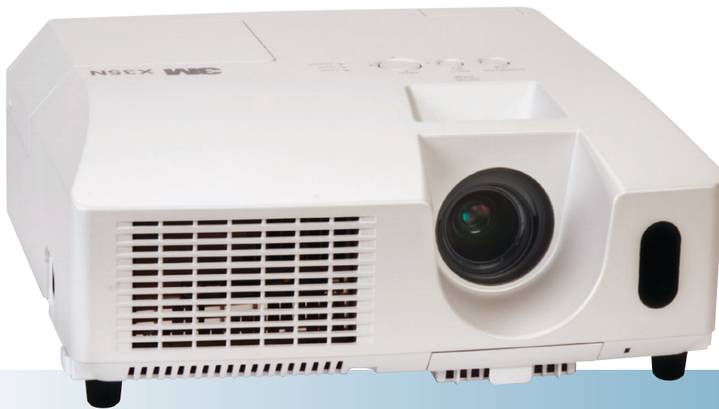
3M X35N Projector 78-9236-7715-3

The 3M Digital Projector X35N features 3,000 lumens of brightness and a 2000:1 contrast ratio for exceptional picture quality. Backed by the 3M brand for superior performance and reliability, the X35N features network functionality which allows effective management of assets to reduce cost of ownership, limit downtime and avoid unnecessary maintenance. Coupled with a new hybrid filter that operates for up to 4,000 hours under normal conditions the X35N is ideal for education and business organisations who are looking for minimal running costs over the lifetime of the projector.